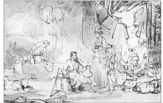
Rebekah at the well - Rembrandt

So I come today to the spring, and ask like Abraham's servant did when he was asked to find Isaac's wife - "O Lord, the God of my master Abraham, if now you will make my journey on which I go successful."