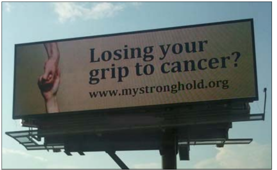
A friend of Stronghold has donated ad space on his billboard.

Sunday, October 2nd @ 6:30 p.m. (reception at 6:00 p.m.) The Hope Center, Plano, TX